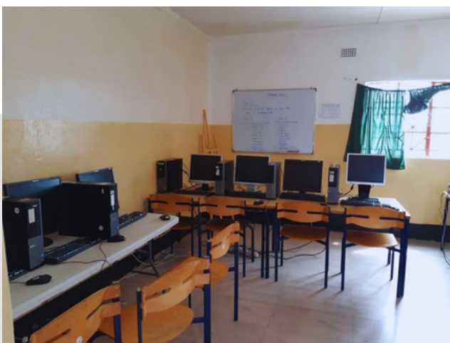
Computer lab for juveniles at Mukobeko Medium Facility

394 juveniles have been supported this year.