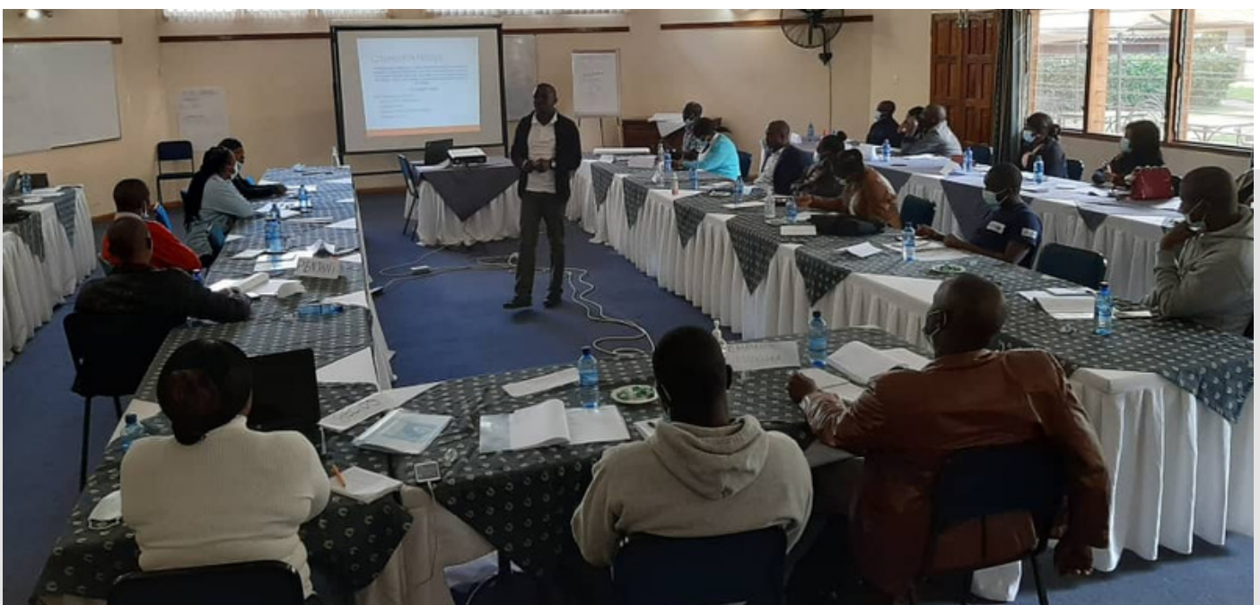
Mental Health workshop for Zambia Correctional Service

In 2021 54 mental health facilitators were trained and 21 support groups were established with in all 206 inmate participants. 42 officers were trained on mental health. 253 inmates were screened for mental health disorders and 198 commenced on medical treatment. More than 6,000 inmates have been targets for mental health sensitisation campaigns. The project has been well received by Zambia Correctional Service and continues in 2022-2025. Thanks to CISU - Civil Society in Development - for the support and to our partner organisation In But Free for the collaboration.