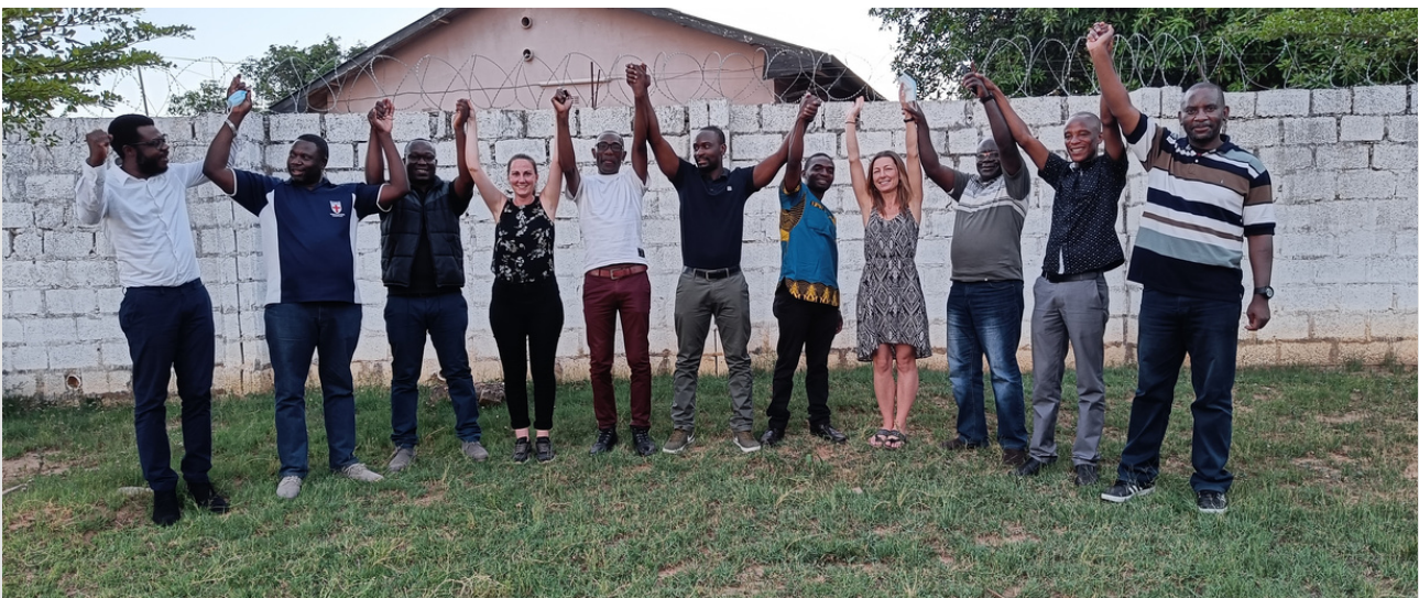
Ubumi Team with Prisoners' Future Foundation

To see all Ubumi staff, please visit www.ubumi.org