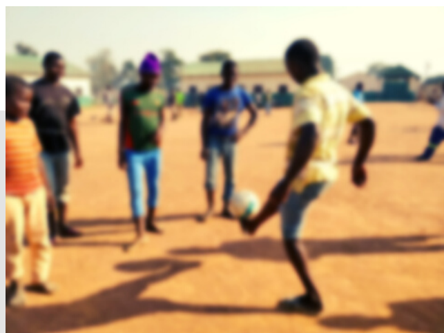
Juveniles playing a game with a volunteer