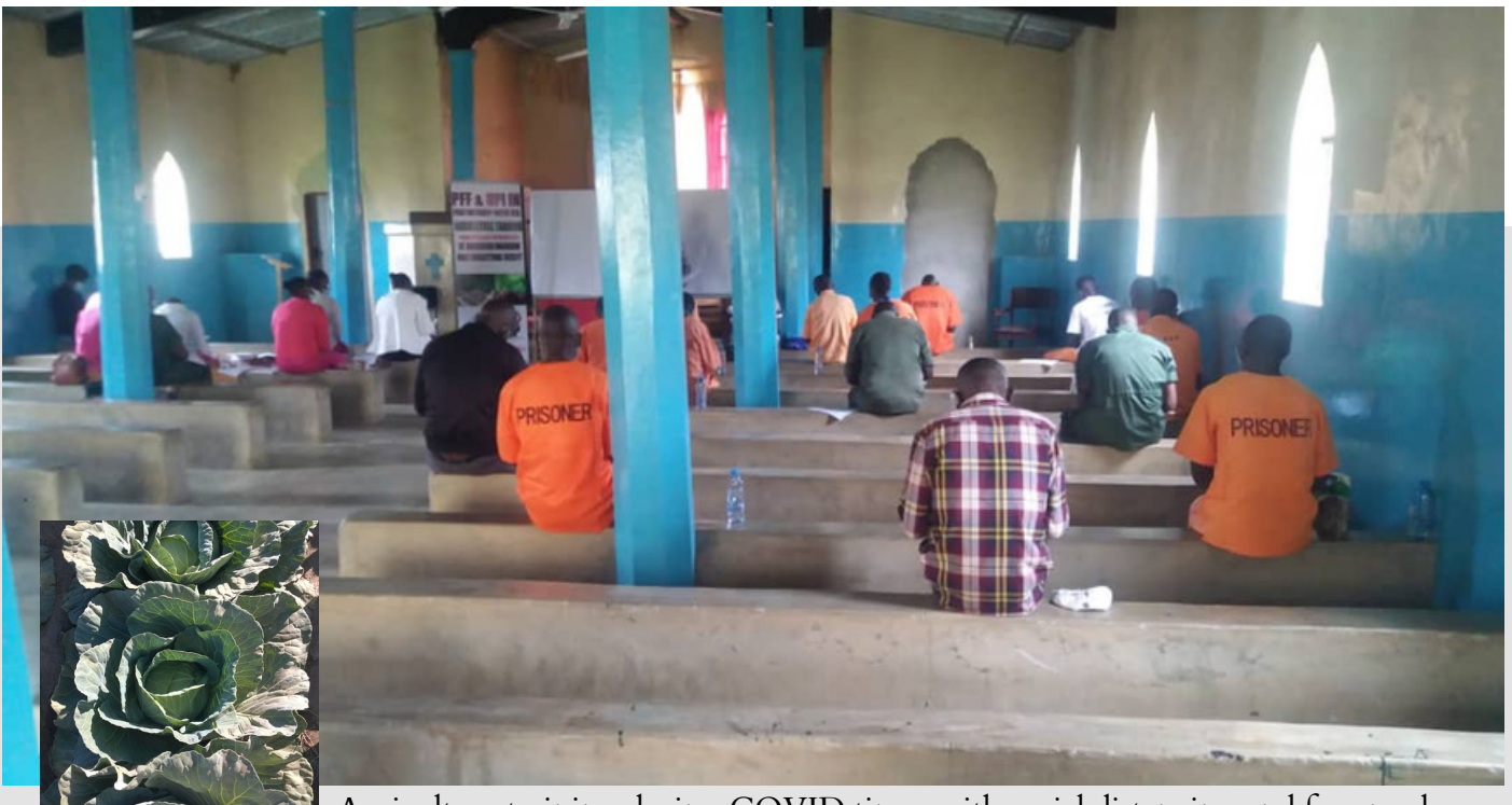
Agriculture training during COVID times with social distancing and face masks

We wish to thank CISU - Civil Society in Development for sponsoring part of this work, and as well as the smaller foundations, individual supporters and the Obel Family Foundation.